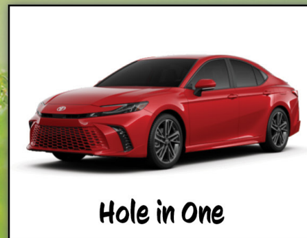
Hole in One