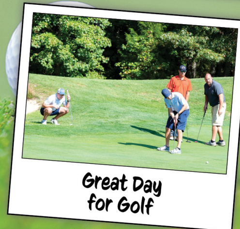
Great Day for Golf