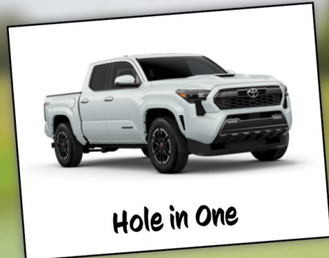
Hole in One