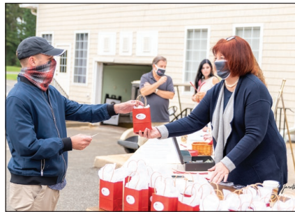
Check In with the CEO Ladies