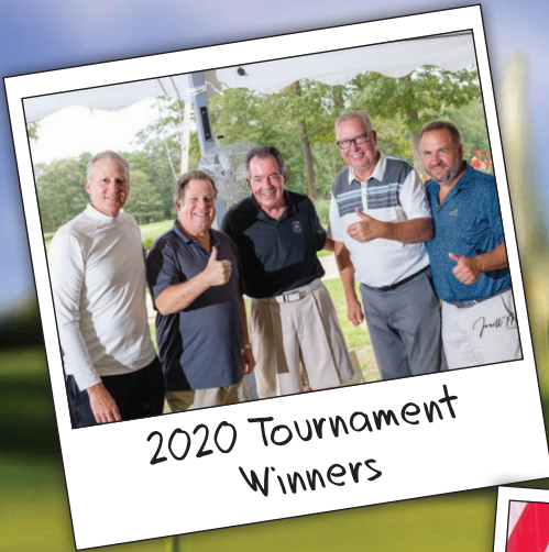
2020 Tournament Winners

Registration and Breakfast 7:30-9 AM • Shotgun Start 9 AM • Lunch following Golf