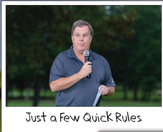
Just a Few Quick Rules