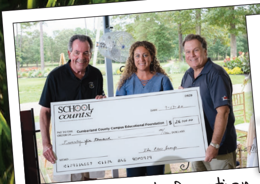
School Counts Donation