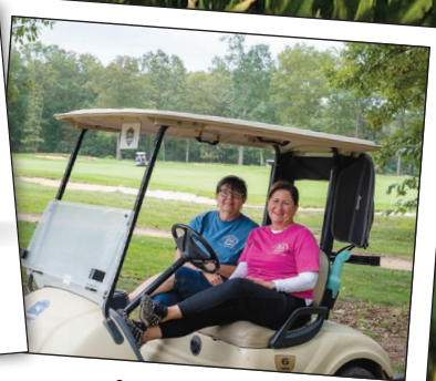
Great Day for Golf