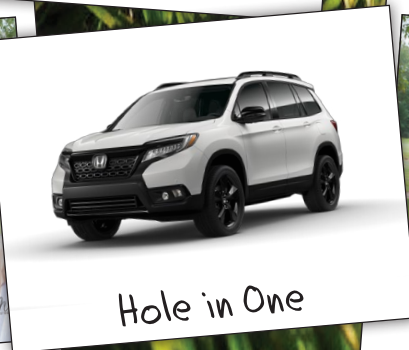
Hole in One